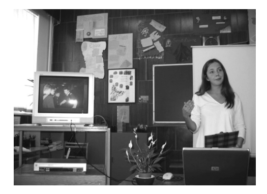
Figure No. 7. A classroom with a technology set (Jelgava, 2004)

ence of the Republic of Latvia, the photographs display also TV-sets, projectors or computers (Figure No. 7). However, none of the photographs explored are devoted specifically to textbooks.