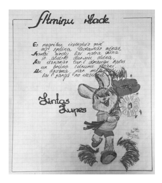
Figure No. 2. The first page of a memory book (Dundaga, 1984)

the entries neat and tidy, also incorporating beautiful illustrations or drawings (Figure No. 2). Both in the records of girls and boys, children are portrayed as goodlooking, healthy, having ruddy cheeks. The only difference is that boys are posing their opinion more directly. The Soviet youth were educated within the Collectivism and Equality ideology – a person is a "citizen" or "member" in the first place, but not a "man" or a "woman." This might be the reason why the records of girls and boys of the Soviet period do not have any significant differences.