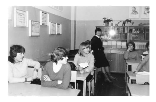
Figure No. 1. Students in the classroom during a lesson break (Riga, 1985)

on the analysis, the conclusion can be drawn that school is viewed as inseparable from learning. The photographs taken after classes also display students posing together with or without teachers, or performing a play during an event, for example, a Christmas party.