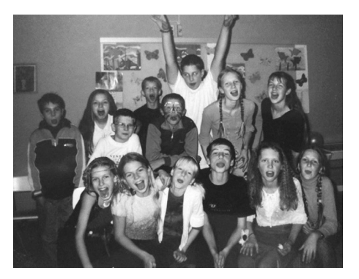
Figure No. 4. Students posing for their teacher (Ozolnieki, 2002)

In the majority of cases, classmates point to one and the same people, which substantiates the presence of leadership in the classroom and, as within any social organization, a certain hierarchy, formed by students on a principle known solely by them. In assessing the owners of these memory albums, girls are usually more open and polite – they state such features as kind-hearted, cool, nice, sweet, friendly, beautiful and smart. In turn, boys use such words as "normal" and "cool."