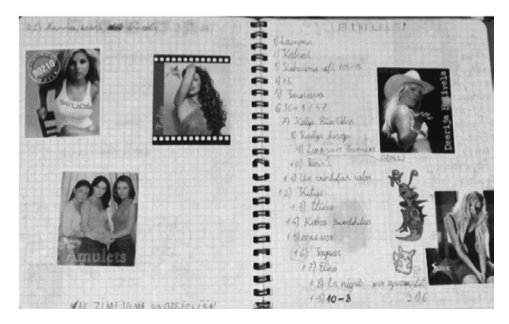
Figure No. 6. A record in a questionnaire (Jelgava, 2001)

and other images. After the restoration of independence and the democratization of the study process, students rarely use copied images, but mostly produce their own drawings as well as used support materials – stickers, stamps, images from magazines, photographs (Figure No. 6).