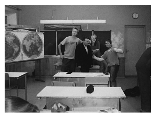
Figure No. 8. Teacher posing with students during the lesson break (Ozolnieki, 2003)

An analysis of photographs revealed the teacher as a conservative person, usually in the background of a photograph, posing together with students during the lesson breaks (Figure No. 8) or standing beside them during a Christmas play or a presentation of homework.