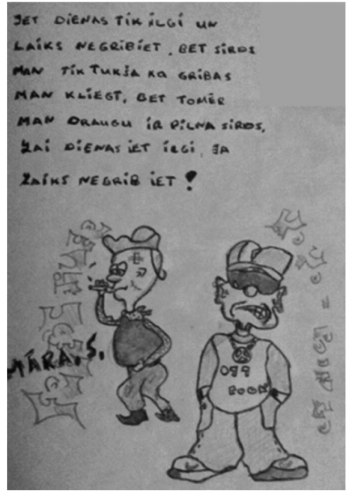
Figure No. 3. Boy-made record in memory book (Jelgava, 2000)

significant differences if compared to the Soviet period. The issue of neatness and tidiness is more topical for girls, parents and teachers, but boys use stickers and humorous stick figures, write poetry of impolite nature content-wise, satirical rhymes or jokes. Boys frequently use images of hooligans, sometimes even having a cigarette in their mouth or rude messages on their clothes (frequently in the English language) (Figure No. 3).