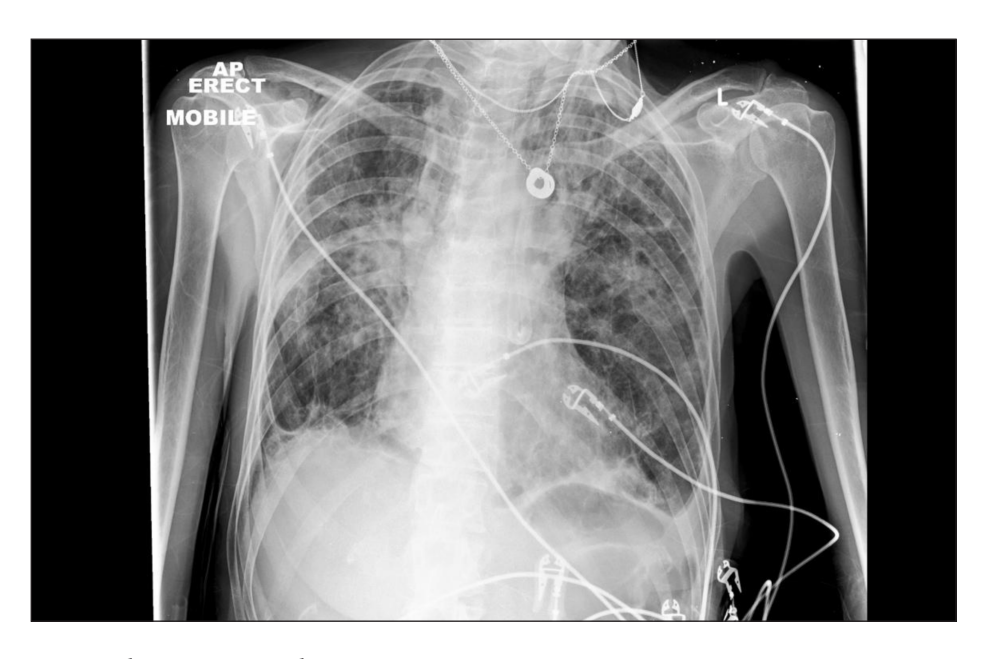
Fig. 1. Chest x-ray on admission

After two days of treatment in the ITU, the patient expressed the wish to stop all treatment measures as she did not see any point in continuing. All of the options (including lung transplant) that were offered to her, as far as her long-term outcomes and quality of life were concerned, were not acceptable to the patient. She clearly stated that she was refusing all of the treatment. She also refused to speak to any member from the palliative team. After completing a mental capacity assessment, the patient was deemed to be compos mentis. A DNACPR (Do Not Attempt CardioPulmonary Resuscitation) form was signed, all active treatment withdrawn, and the patient was started on the "End-of-Life Pathway". The patient died within an hour, surrounded by her family.