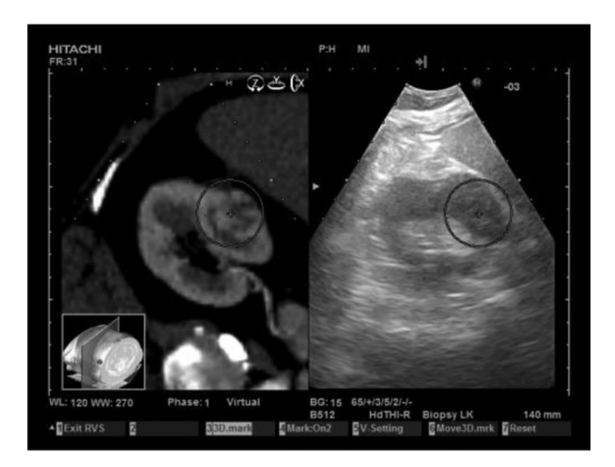
Fig. 1. US controled RFA with CT navigation (Real-time Virtual Sonography)