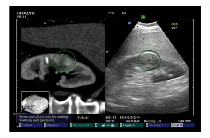
Fig. 2. Fiducial markers placement around the kidney tumor and US controled RFA with CT navigation

allows you to view a live ultrasound machine image compatible with the next screen identical to a moving magnetic resonance or computer tomography images (Fig. 1).