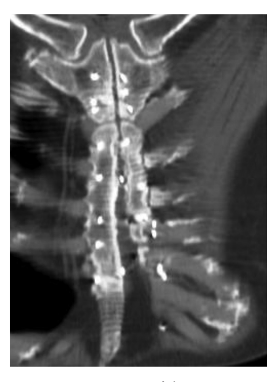
Fig. 1. Preoperative CT-scan of the sternum. Distance of approximately 20 mm between bone edges is clearly visible in the lower part of the sternum

The operation was performed under the general anaesthesia on April 17, 2012. The prior median sternotomy incision was opened and six broken steel wires were removed. The major pectoral