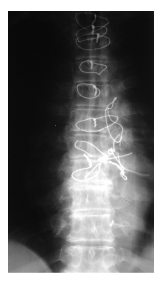
Fig. 2. Six broken wires of eight are seen on the preoperative chest X-ray