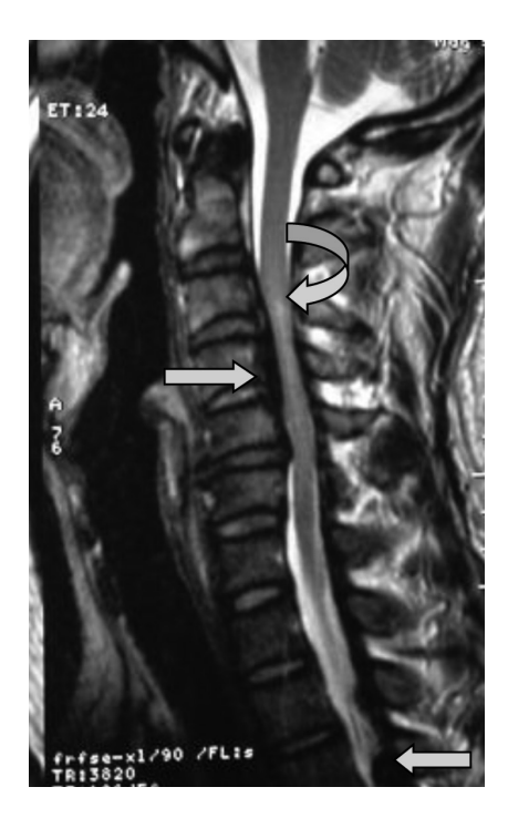
Fig. 1e. Sagittal T2-weighted MRI reveals the spinal cord injury (curved arrow) predominantly at C3–C4 (intramedullary area of high intensity signal). PLL is uniformly hypointense (right arrow) at C3 through C6. Hypointensity at T3–T4 corresponds to the left sided ossified ligament flavum (left arrow)

MRI (Figs. 1d, e) revealed a prominent linear signal void abnormality of the OPLL at the C3–C4 through C6–C7 levels narrowing the anteroposterior diameter of the canal and compression of the sac and cord. At T3–T4 the left sided ligament flavum was hypointense, corresponding to its calcification. Central intramedullary hyperintensity was identified on T2-weighted images at the C3–C4 level (Fig. 1e).