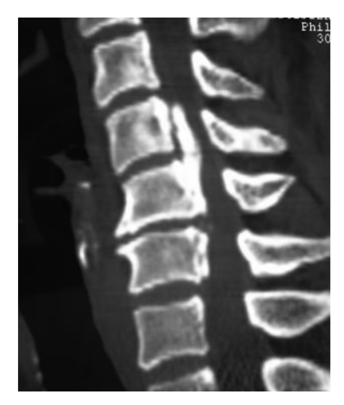
Fig. 1c. CT scan confirms stenosis of the cervical canal attributable to calcified PLL on sagittal reconstructions. At the narrowest level the sagittal diameter of the spinal canal is reduced to 5 mm