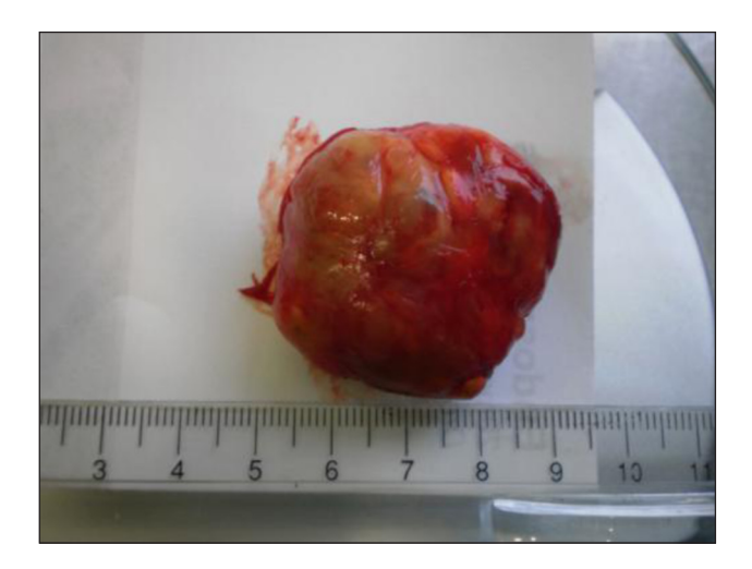
Fig. 3. Tumor – facial nerve schwannoma

end-to-end suture and tubulisation with autologous vein. Postoperatively the patient developed facial nerve palsy.