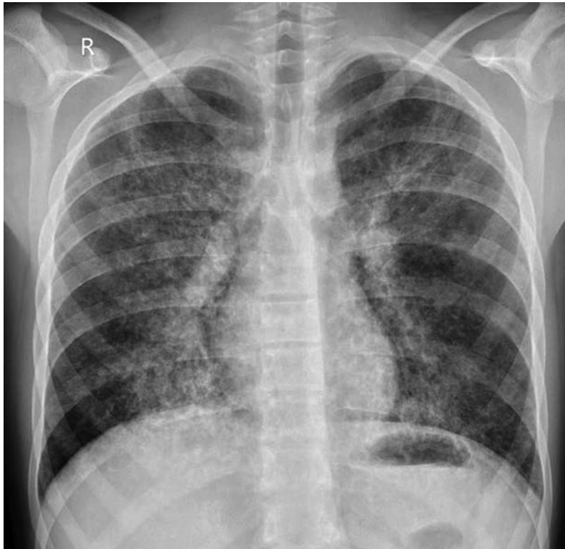
Figure 1. Chest radiograph. Fine bilateral interstitial infiltrates with interstitial edema.