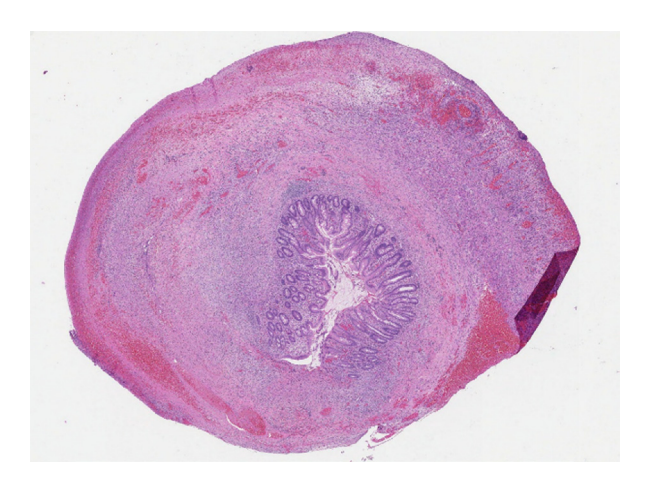
Figure 4. Histology of the surgical specimen

The most recent literature about neonatal appendicitis mostly reports isolated cases and larger studies are rare. The first case descriptions were autopsy reports and they emerged in the early 20th century [2]. Appendicitis in neonatal population is extremely rare with 141 cases reported since 1905 to 2000 [3]. Incidence is reported to be 0,04% to 0,2% [1,3-5]. Low incidence is attributed to the