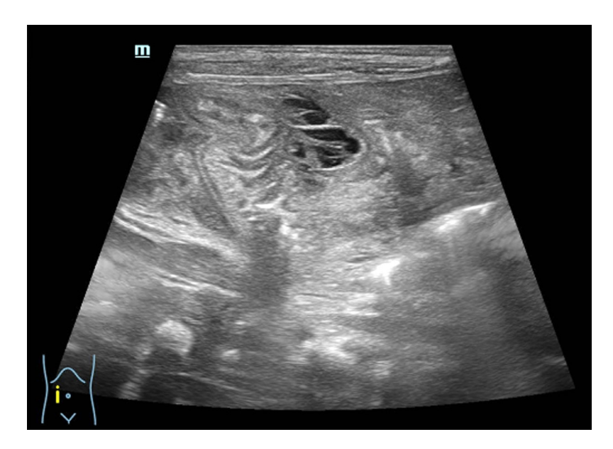
Figure 1. Ultrasonography on third day of admission showing an inflammatory mass

Newborn was transferred to the neonatal intensive care unit (NICU). Diagnosis of inflammatory lymphangioma, mesenteric cyst and necrotizing enterocolitis was considered. Abdominal X-rays showed slightly distended bowels. Parenteral nutrition was started along with antibacterial therapy of meropenem while the diagnosis of necrotizing enterocolitis was most likely. Condition remained stable until the 6th day of admission when the newborn became febrile, passed no stools, the ultrasound scan of the abdomen showed fluctuation, oedemic pneumatized bowel walls (Figure 2) while abdominal X-rays remained unremarkable (Figure 3).