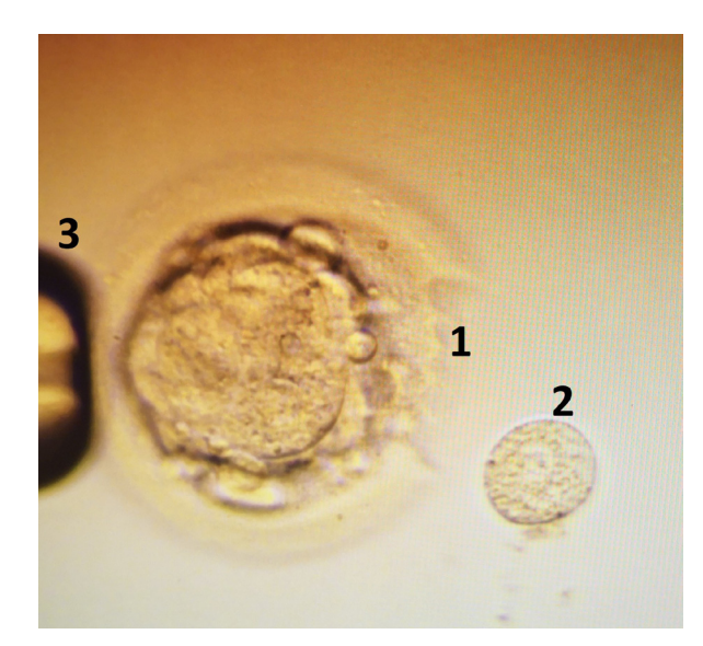
Figure 1. Laser assisted 4th day embryo (morula) biopsy. 1 – laser ablation of zona pellucida , 2 – biopsed single blastomere, 3 – holding pipette.

Holding micropipettes (Reproline, Germany) under an inverted Nikon Eclipse Ti microscope (Nikon, Japan). After ICSI procedure all embryos were cultivated in 50 microliters drops in the one step SAGE medium (Origio, Denmark) under the mineral oil (Irvine Scientific, USA). All embryos were revised 24, 48, and 72 hours after ICSI. According to the development speed of embryos, on day 3–4, the single embryo blastomere biopsy was performed using 1480 nm / 400 mW solid state diode laser with a pulse length range 0.005-2.0 \text{ ms} / 5-2000 \mu \text{s} (RI Saturn 5^{\text{TM}} , Research Instruments, UK) and RI Integra TM 3 micromanipulator (Research Instruments, UK) (Figure 1). Single use 50 micrometers Biopsy pipettes (Reproline, Germany) for the single blastomere biopsy were used.