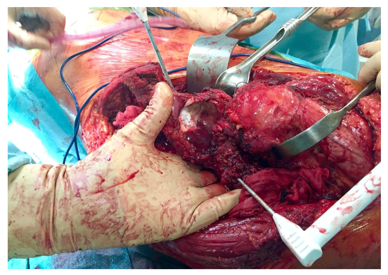
Figure 2. Surgical resection of a metastatic renal cell carcinoma involving the pelvis (exposed in the picture). An example of an orthopedic oncology intervention burdened by high risk of intra-operative blood losses.

Coagulation apart, a further concern with oncologic cases candidate for surgery is their frequent pre-existing low levels of haemoglobin. Anemia may be attributable to continuous blood dripping, bone marrow infiltration, nutritional deficiencies but also to the metabolic changes induced by the tumor. An important role is to be credited to the huge secretion of cytokines, including IL-6, which inhibit the production of erythropoietin and reduce the intracellular intake of iron molecules [26-28]. These criticalities could be made even more evident for those cases treated with chemotherapy due to its myelosuppressive effects.