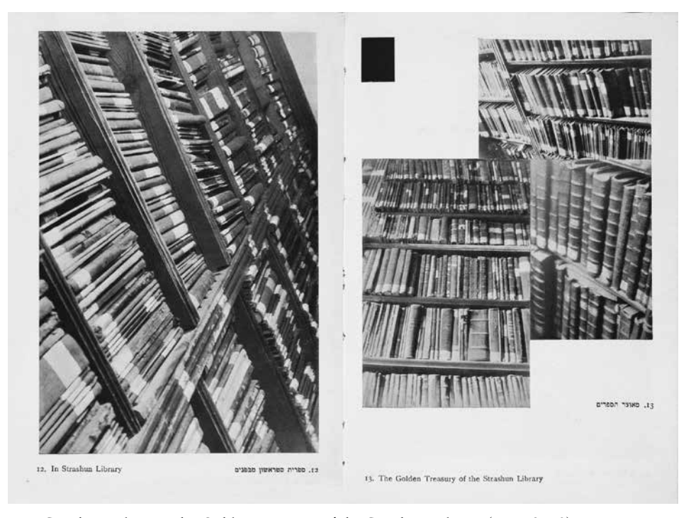
7. In Strashun Library. The Golden Treasury of the Strashun Library (Fig. 12, 13).