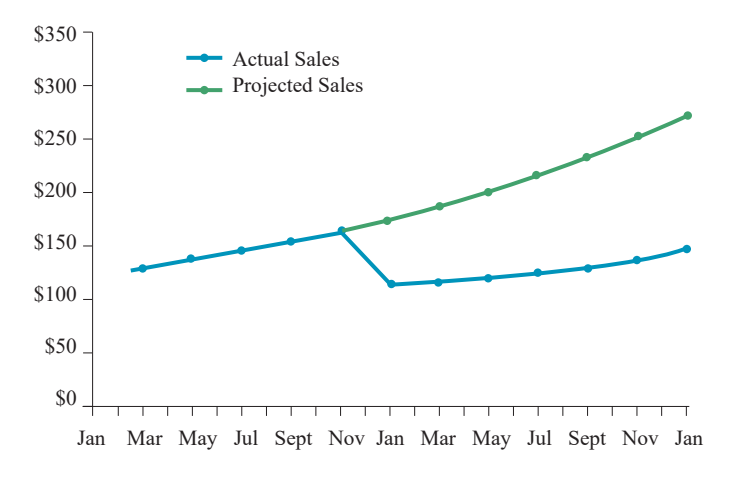
Fig. 2. "Before and After" Approach