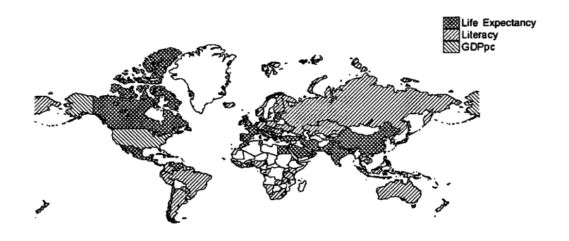
Fig. 3: DEA HDI component dominance

tancy contributed more than education or GDP to the overall development index, in forty-five countries education was the main contributor, and in six countries material development as measured by GDP dominated the other categories (See Figure 3 below and Appendix 1 for details).