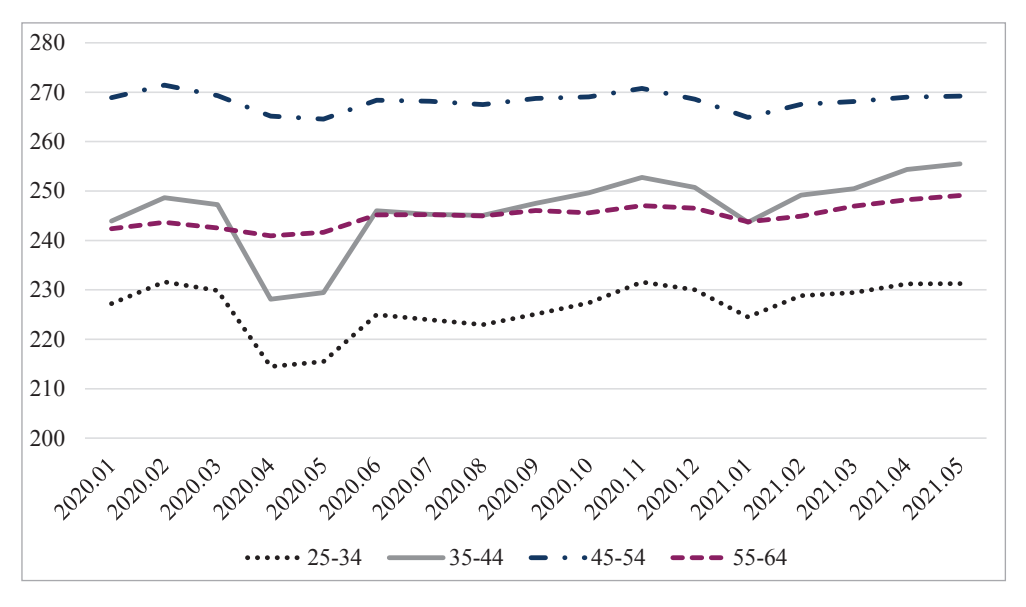
Figure 2. Number of insured persons who worked full month (thousand persons), from January of 2020 to May of 2021

In the first months of quarantine, the number of insured persons who worked in Lithuania for the whole month decreased. The fall was different in different age groups, in April, compared to February, the number of insured persons aged 25–34 decreased by 7.4%, those aged 35–44 – by 8.3%, those aged 45–54 – by 2.3%, 55–64 year – 1.1% (Figure 2).