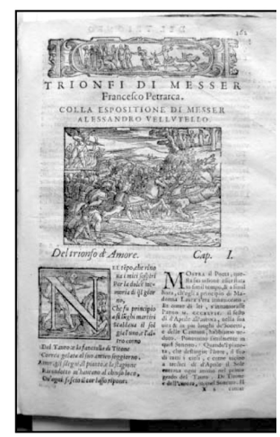
Figures 3, 4. Two editions of Petrarch; the first example was designed for scholars under the influence of Platonism (Venice, 1533; NUK 2124/7); the second edition, designed with illustrations, is an example of artistic expression influenced by Aristotelian philosophy (Venice, 1563; NUK 2181/6)