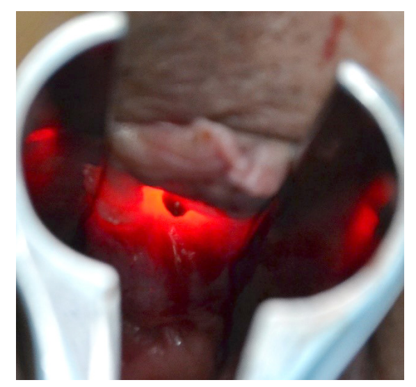
Figure 2. Elimination of the fistula

underwent fistula excision with the elimination of the internal opening (Figure 2), suturing its stump in the perineal wound (including the method of Redheads), in the second control group – 84 patients (36.9%) performed radical fistula excision with segmental proctoplasty (moving the U-shaped full-layer mucosa flap of the rectum and its fixation in the anal canal).