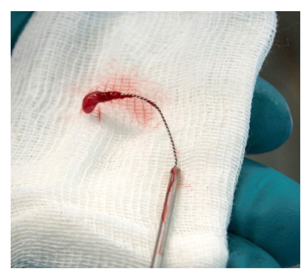
Figure 3. Removal of necrotic tissues using a special pointed brush

period. If in the control groups, antibacterial therapy was prescribed in all cases, in the main group, only 2 patients were treated when inflammatory changes appeared in the projection of the external fistula.