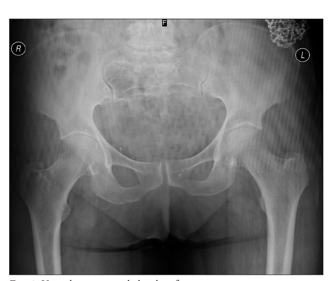
Fig. 1. X-ray has not revealed a clear fracture