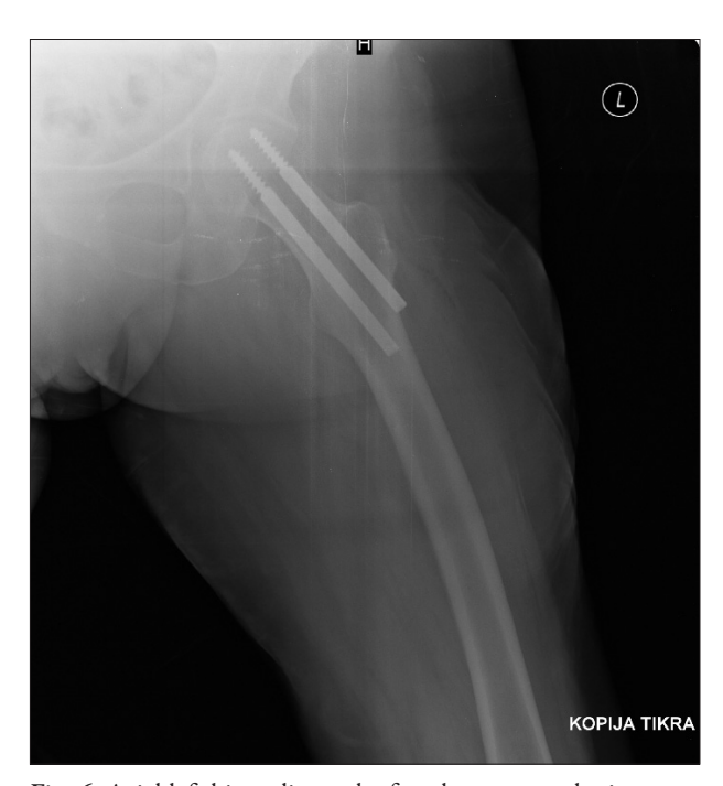
Fig. 6. Axial left hip radiograph after the osteosynthesis