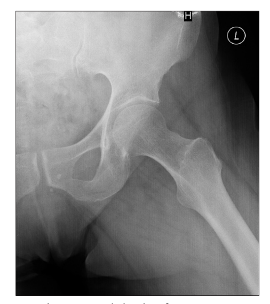
Fig. 2. X-ray has not revealed a clear fracture

A 73 year old woman applied due to pain in her left hip area. The patient said that she had fallen at home. After the trauma she could walk. During examination the left hip joint area was painful when rotating outward. The fracture was not diagnosed on the front both hips (Fig. 1) and left hip axial (Fig. 2) radiographs. A contusion of her left hip was diagnosed and the patient went home. After ten days pain in the left hip became very intense and the patient turned to the emergency department repeatedly. Computer tomography was done at once and it showed a left femur neck fracture (Fig. 3 and Fig. 4). Urgent osteosynthesis with Ullevaal screws was done (Fig. 5 and 6). The patient is still alive and walks without any help after one year from the operation.