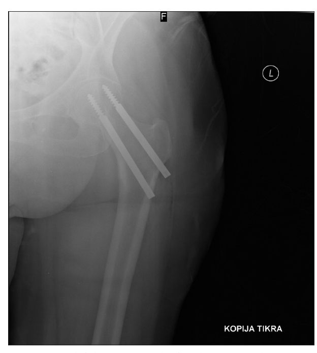
Fig. 5. Front left hip radiograph after the osteosynthesis