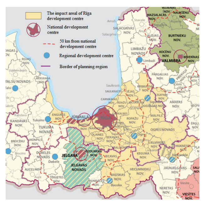
Fig. 1. The territory of Rīga planning region and impact areal of Rīga development centre

The research on well-being in terms of public services was carried out in Salaspils municipality, The municipality is located in the central part of Latvia. Salaspils is a suburb of Rīga, the capital city of Latvia. In 2004 Salaspils city and Salaspils district municipalities were formed with the administrative centre in Salaspils. In 2010 Salaspils municipality was formed. About 23 000 people are living in the administrative centre, other 2 000 - in its rural area. In Soviet times many blocks of houses were built in Salaspils for builders and workers of the Hydroelectric Power Plant, Thermoelectric Power Plant, Nuclear Power Plant and other plants According to statistics Latvia, the municipality is most densely populated (over 200 people per km<sup>2</sup>, Latvia's average – 33.8 people per km<sup>2</sup>). Since 2009 positive population growth has been registered (1,2%), in Latvia – 3,9%). Because of its relative overpopulation, intensive traffic, closeness to Rīga (18 km) from Salaspils), as well as some industrial pollution sources (asphalt production plant, fertilizer production plant, mechanical workshops, former Nuclear Power Plant) it, is one of the most polluted municipalities in Latvia (see Fig.1).