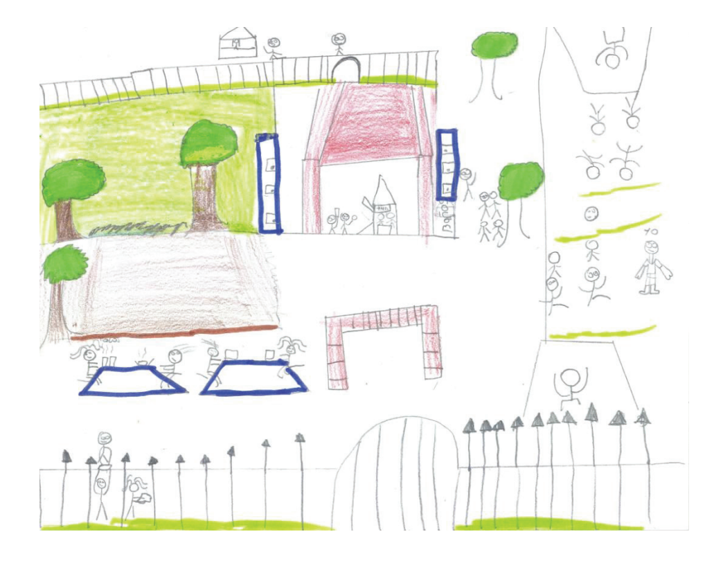
Fig. 1. Gudelio's Drawing of his School in Yoliztli